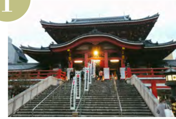
Release: Freedom in the precincts HP

Enjoy the straight street filled with famous shops.