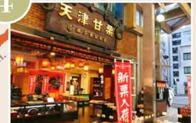
Open Mon.-Sun 9:30-19:00. Closed irregular holidays. HP

Chestnut shop | Banshoji main shop Imai Sohonke