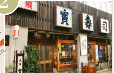
Open Mon.-Sat. 11:30-15:00 17:00-21:00 Sun Holiday 11:30-21:00 Closed Thursday.

The main shop of Matsuya coffee, which has 100 years of history.