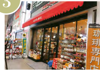
Open Mon.-Sun 9:30-19:30. Closed irregular holidays. HP